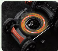
Top Rated Deck Air Flow