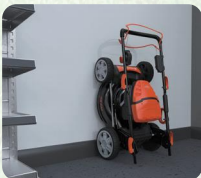
Smart Vertical storage