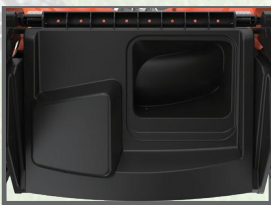
Integrated Mulch Plug