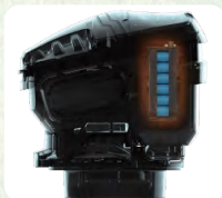
Floating Pack Structure