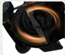
Smooth Deck, Strong Air Flow