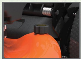
Deck Wash Port